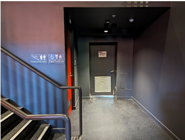
Note: This is an all gender toilet that is wheelchair accessible and has a baby change table