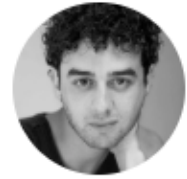
ENSEMBLE TOMÁŠ KANTOR