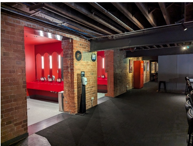
Bathrooms on Mezzanine (up 1 flight of stairs):