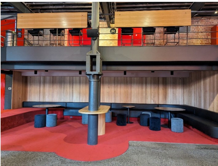
Box Office in the Foyer: