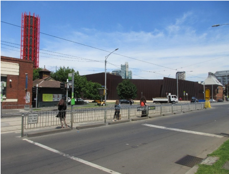
Pictured: The view of Stop 18 with Malthouse and ACCA in the distance

The Malthouse is located at 113 Sturt Street in Southbank. You can get here by tram, train, bike or car.